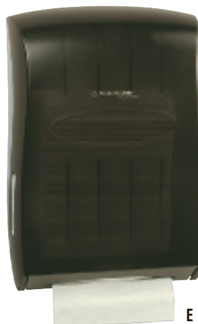
Dispenses SCOTTFOLD* towels.

See pages 247-269 for Facility Maintenance & Safety