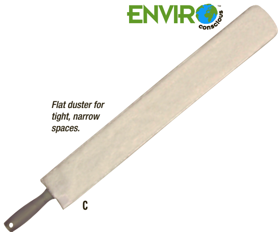
Flat duster for tight, narrow spaces.