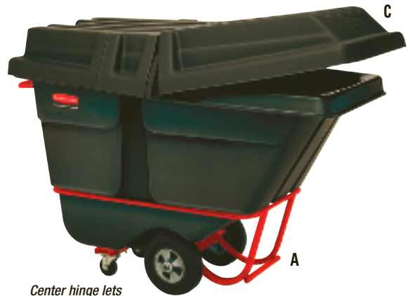
Center hinge lets lid open from either end.